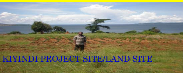
KIYINDI PROJECT SITE/LAND SITE

Please we request that you help for example the Kiyindi project will need around 1475 pounds for the purchase of the land. We are also looking for transport since we are around 10 miles away from tarmac road. In what ever way you can support please help less join hands and make Africa a better place